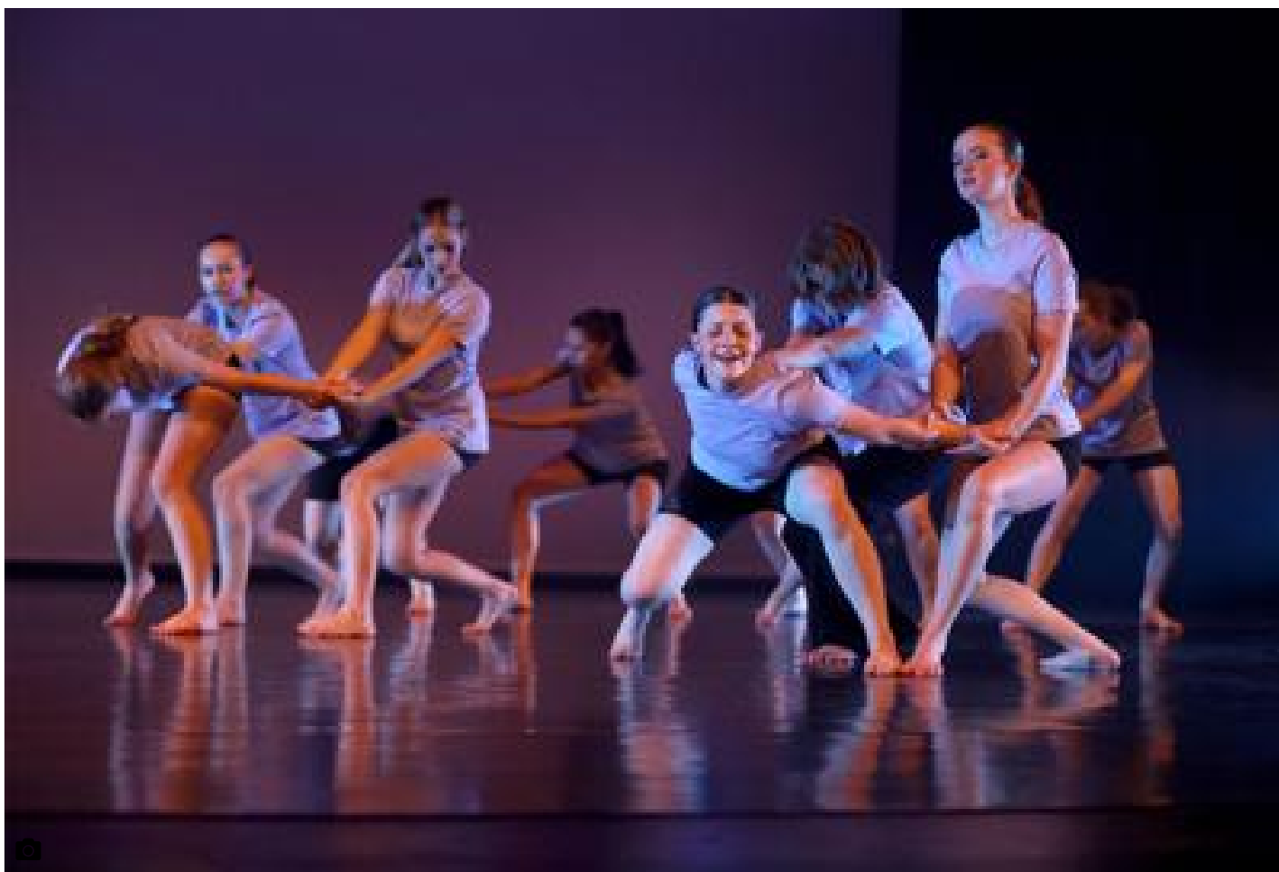
Gallery: FALA presents its spring dance show

She also mentioned teachers' genuine care about their work and students as one of FALA's strengths, saying there were "a lot more" excellent teachers than just the ones she named.